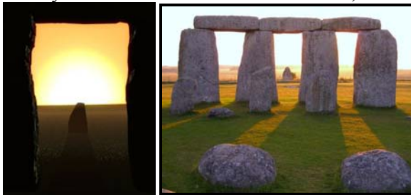
Sunrise views toward heel stone

In the diagram above, the avenue at upper right points to the northeast, where the sun rises in summer. On solstice, to an observer within the stone circle, the sun appears to rise directly over the heel stone on that avenue, as below.